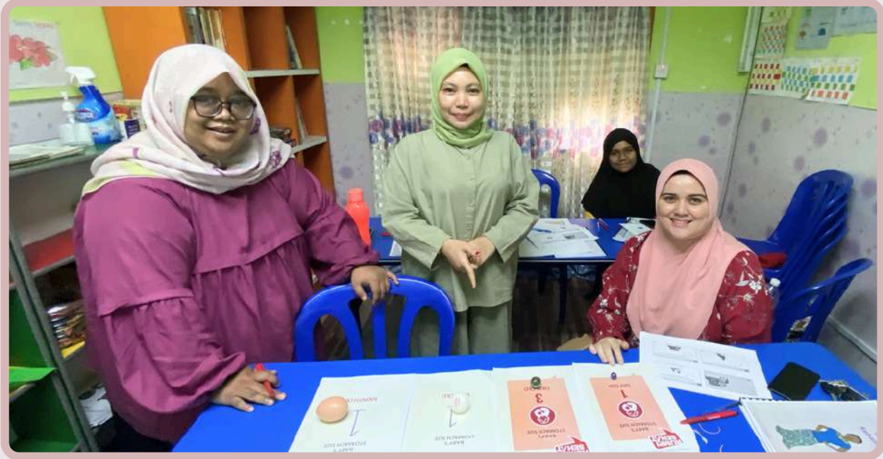
Trainees learning about size of an infant's stomach