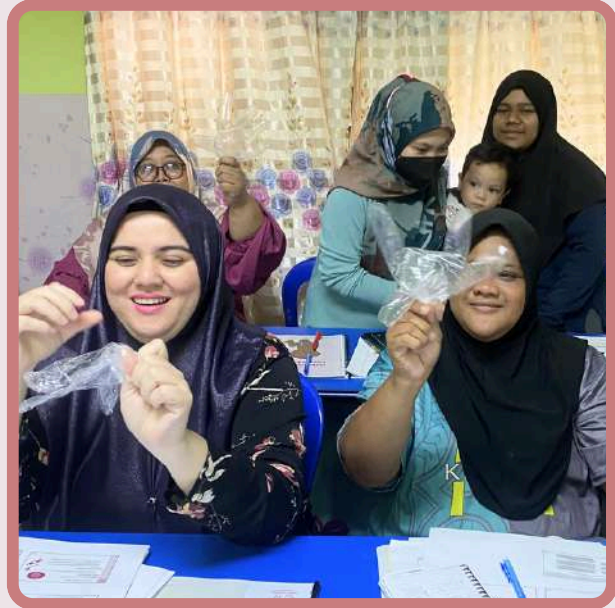
Trainees learning about hand hygiene