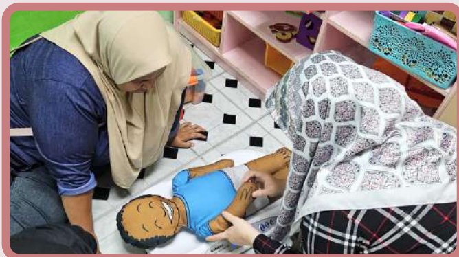
Trainees learning about child measurement