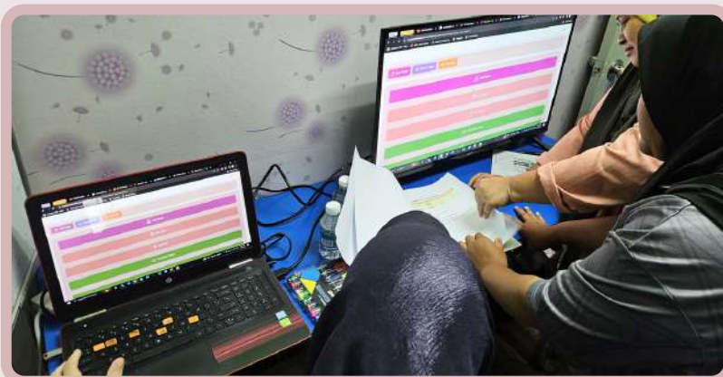
Trainees utilising HMF-DS online training materials