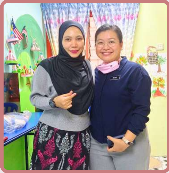
Visit by nutritionist from local health clinic